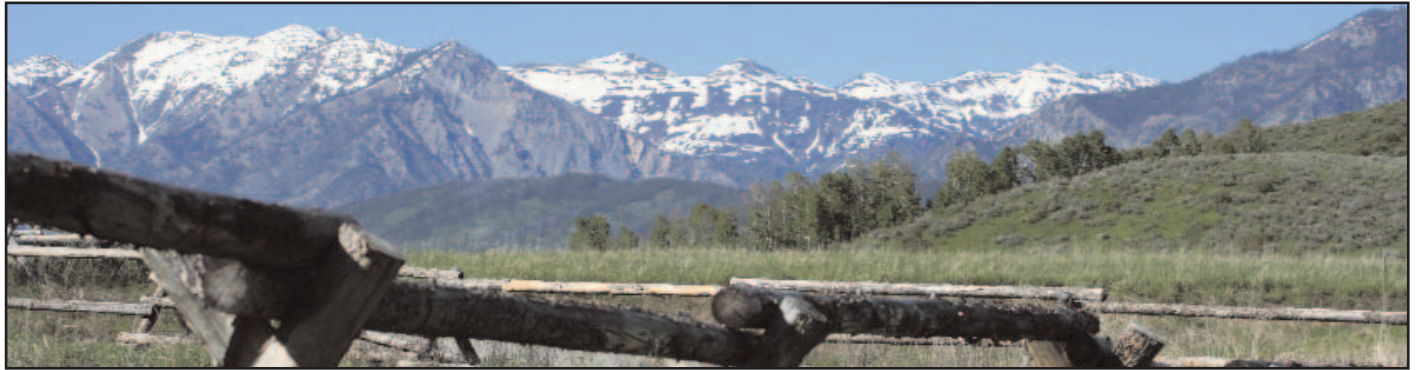
The gorgeous views in Star Valley are just one of the reasons so many people are interested in calling this area home.

Star Valley, WY and Teton Valley, ID thrive with more dollar volume Year-to-Date